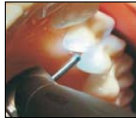
Optic - NSK LED