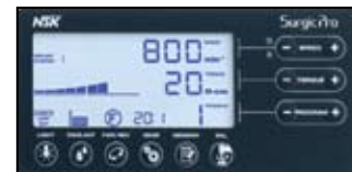
Simple and Intuitive Operation Control Panel