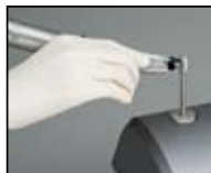
Control Unit with Advanced Handpiece Calibration (AHC) - High Torque Accuracy